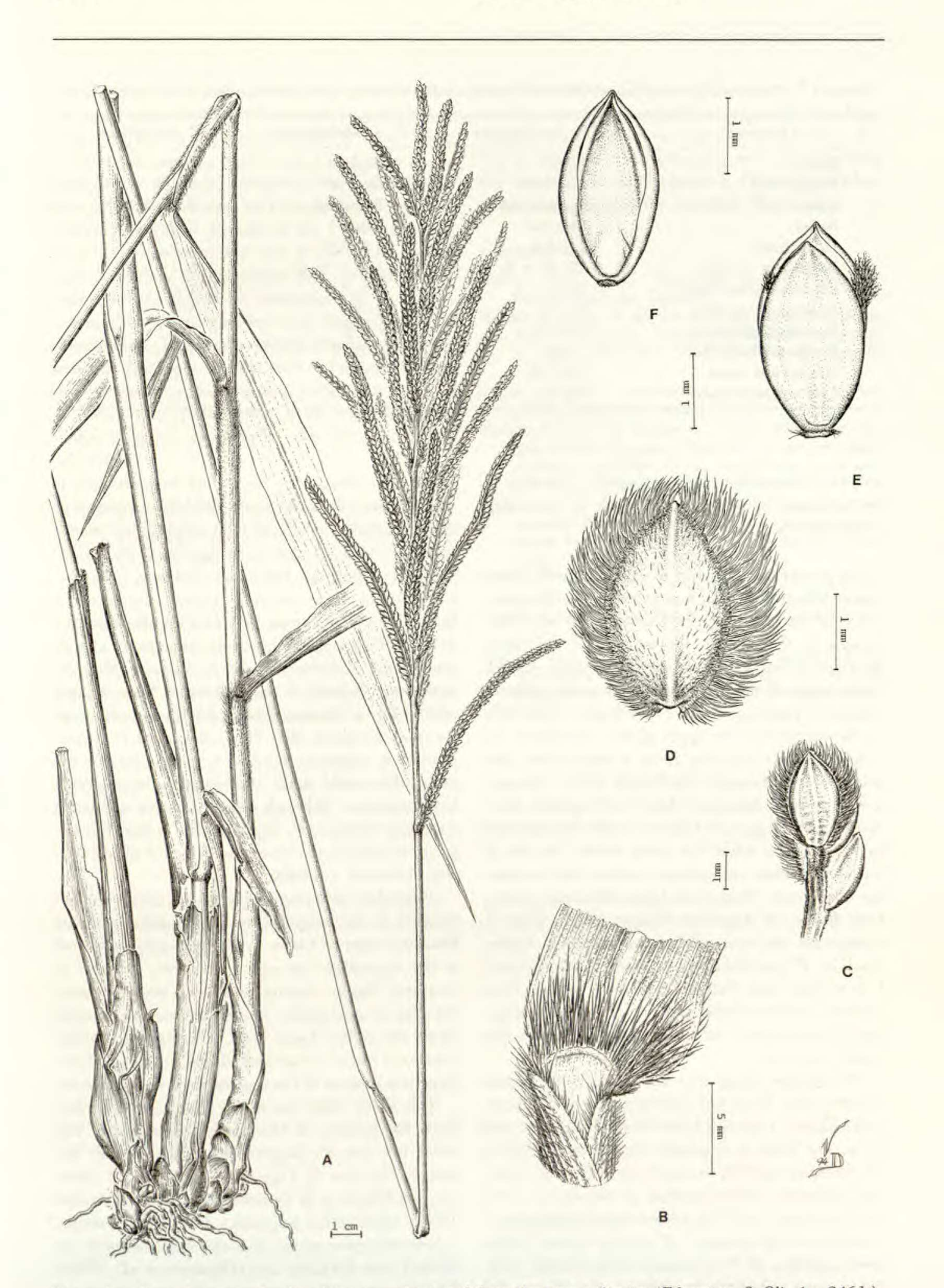
Figure 1. Paspalum niquelandiae Filgueiras, illustrated from the type collection (Filgueiras & Oliveira 2461). -A. Habit. -B. Ligular area of leaf. -C. Portion of a raceme with paired spikelets. -D. Dorsal view of spikelet. -E. Upper floret, lemma side. -F. Upper floret, palea side.